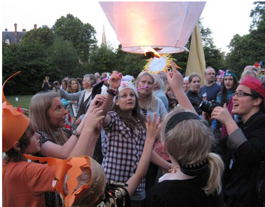
Lift-off! One of the small hot air balloons takes flight during the opening ceremonies

With Ibu’s greetings read, we felt the awakening spirit; a renewed sense of purpose; a new willingness for international enterprise, putting the traumas of the past behind for the sake of the growth of Subud; collaborating; putting Bapak’s kedjiwaan advice into inner and outer practice; building on the quality that we have.