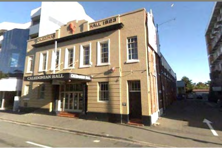
Caledonian Hall, before and after

The human cost is very heavy: disturbing images will horrify the children for a long time, something grand in the aspect of a city that was familiar and comfortable is gone, homes gone, work disappearing, businesses and institutions crumbling before our eyes, and the very earth not to be trusted. I am thinking of a friend: a good, kindly, talented, light-hearted, friend buried in the rubble of one of our fine old churches. This is essentially a small town and I know that my sad feeling is going click, click, click through a line of thousands of hearts tipping like dominoes.